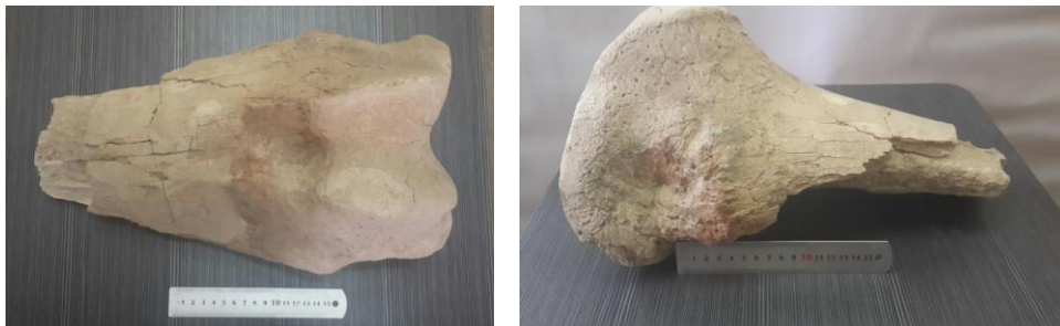
Plate (1): Bone fossil, femure of Proboscidea, mastodons (in two views) was collected from Injana Formation near Tharthar Lake- Middle of Iraq (scale: 15 cm).