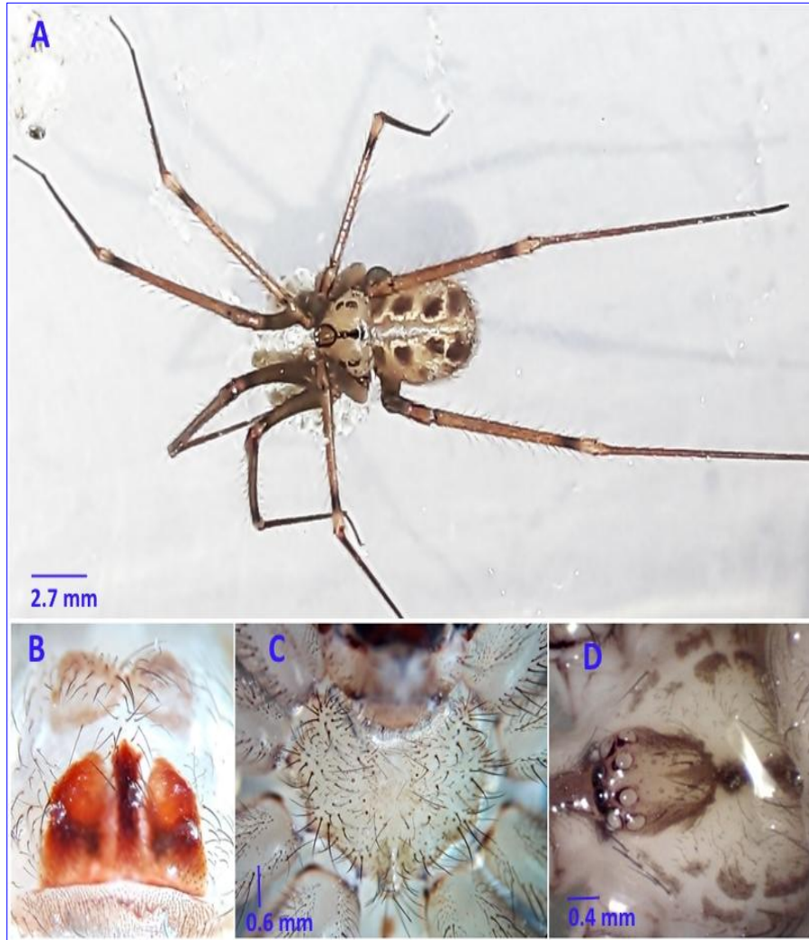
Plate (2): Female of A. doriae ; (A) Habitus, dorsal view, (B) Epigynum, ventral view, (C) Sternum, (D) Carapace and arrangement of eyes.