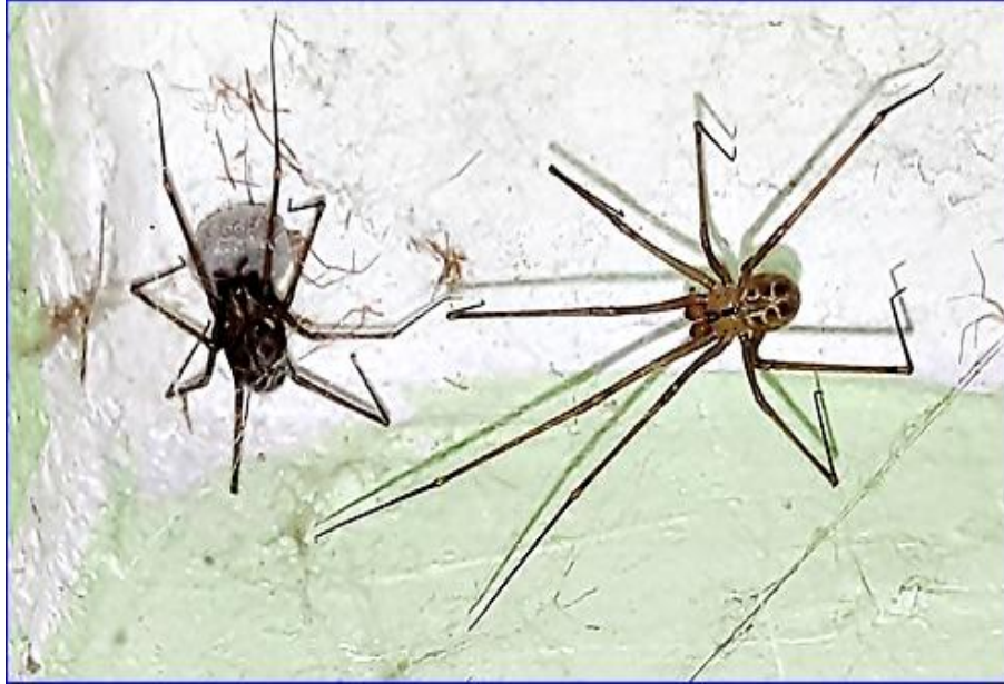
Plate (3): Habitat of A. doriae ; A. Male (right) and female (left) hanging in the roof of a building in a rural region, Al-Naser district, Dhi Qar, Iraq.