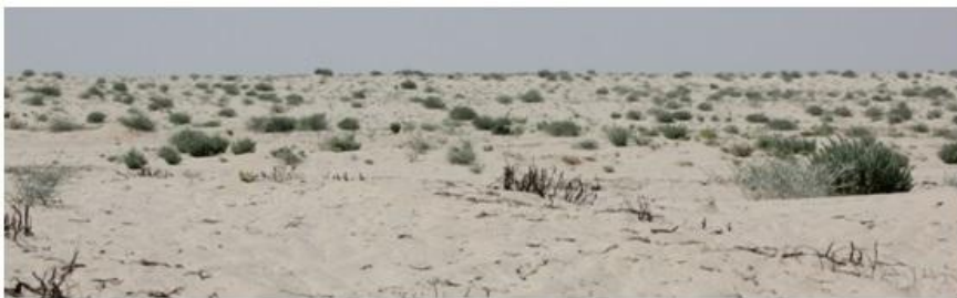
Fig.2: Habitat of P. maculatus , Eastern Sawa Lake –Al-Muthanna province / South West Iraq. Photographs by Ali N. Al-Barazengy/ August 2013