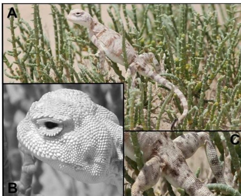
Fig.3: (A) Female Phrynocephalus maculatus longicaudatus Haas, 1957. (B) Side view of the head showing 5 rows of scales between eye and lip. And have enlarged posterior supraorbital scales larger than mid-dorsal scales typical for ssp. longicaudatus Haas, 1957. (C) Rearward view showing no fringe of scales on posterior border of thigh and side of tail. Photographs by Ali N. Al-Barazengy Um Al-Rouge area Al-Muthanna province in may 2013.

In our surveys we found one P. maculatus in each site. The first was climber on plant Haloxylon salicornicum , the other was procumbent on the sand. The phenotypic characteristics of the tow specimens coincide with diagnosis of P. m. longicaudatus Haas, 1957, (figs. 3, 4). The head is short and broad, roughly looks like a heart on top view. Forehead convex, with slightly enlarged scales, slot big mouth, no cutaneous folds at angle of mouth, no fringe of scales on posterior border of thigh and side of tail, side of head and neck without projecting fringe-like scales, dorsal scales homogeneous, no enlarged scales along flanks, scales on vertebral region considerably larger than those on flanks, nostrils are separated by one to three scales. Differs from P. m. maculatus in having posterior supraorbital scales strikingly flattened and enlarged, longer than wide, and larger than mid-dorsal scales; a few dorsal scales are keeled or with an indication of mucronation; nostrils are directed forward instead of upward; tail is longer than twice the distance from the gular fold to the vent; dark coloration of the distal part of the tail is pronounced ventrally.