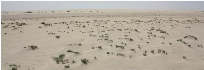
Fig.1: Habitat of P. maculatus at Um Al-Rouge area-Al-Muthanna province / South West Iraq.

In summer 2013 the Iraqi Ministry of Environment carried out a field survey to study the wild birds in the important biodiversity areas in AL-Muthanna province, which is one of the largest provinces South West part of Iraq. Most of the province is located in Ecoregion: Arabian Desert and East Sahero-Arabian xeric shrublands (PA1303) according to World Wildlife Fund (WWF, 2014), and the encyclopedia of earth (2015). The biodiversity of this region is the least known in Iraq (Iraq fourth National Report to the Convention on Biological Diversity 2010). Many sites North, South, East and West the province were surveyed, during which two specimens of P. maculatus were collected, for the first time in late spring to the South of Al-Khader city (40Km Southeast of Al-Samawah city) in the part of sandstone North and Northeast of the province; the other one seen in mid-summer sandy area Eastern of Sawa Lake (28Km Southeast of Al-Samawah city).